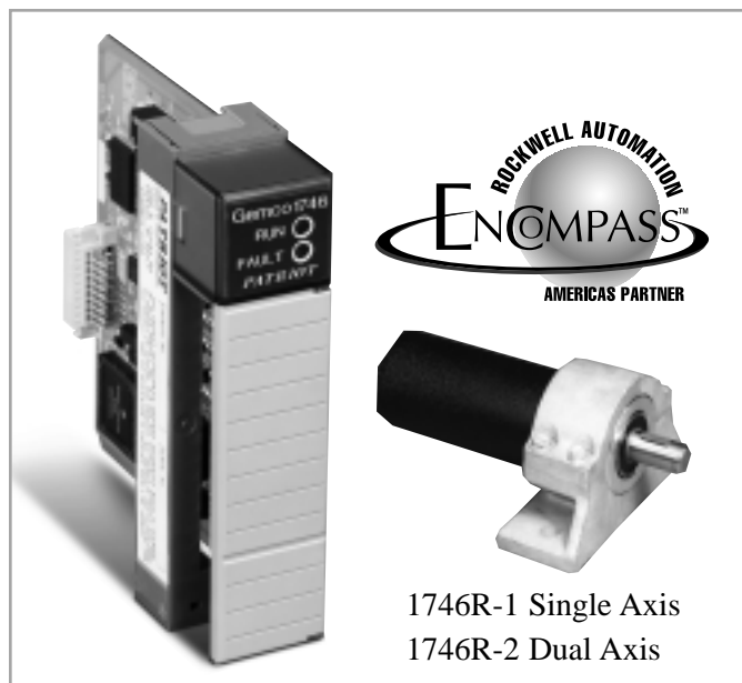
1746R-1 Single Axis 1746R-2 Dual Axis

■ Gemco is a trademark of Ametek Patriot Sensors.